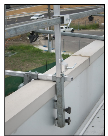
Figure 2: Clamp On Bracket