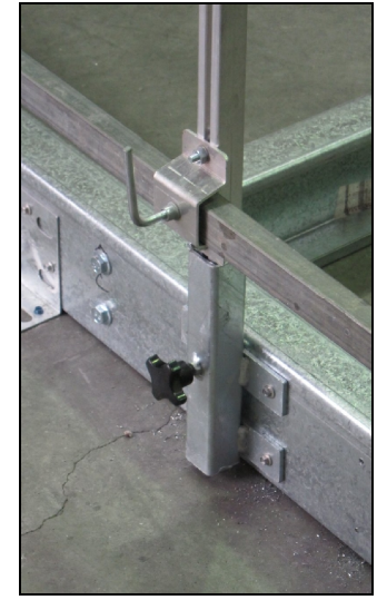
Figure 6: Gable End Bracket