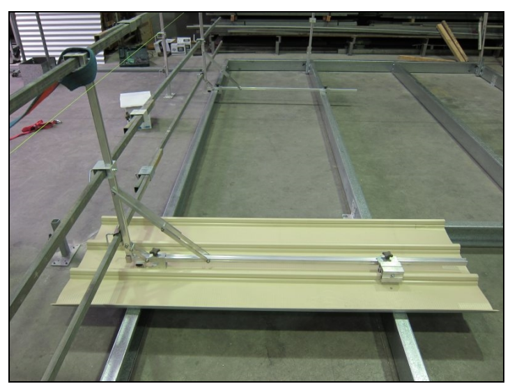
Figure 5: Deck Fixing Clamp