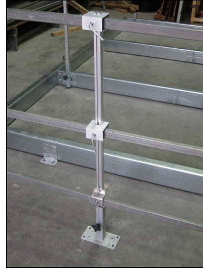
Figure 1: Bolt On Bracket