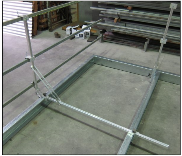
Figure 3: Perimeter Handrail with C-Purlin Clamp